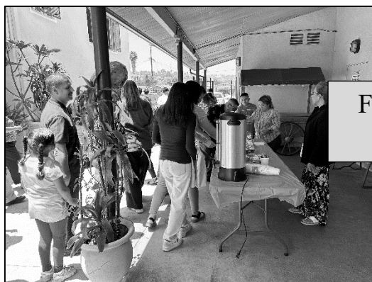
Father's Day gifts and celebration