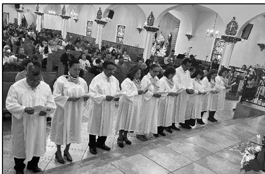
Eucharist Group Ceremony