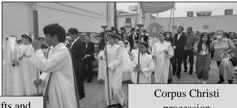
Corpus Christi procession